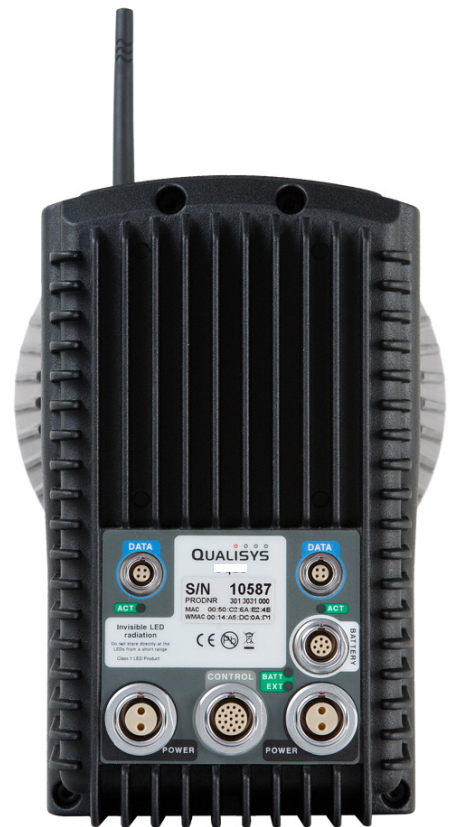
Input/output. The power, data, sync in/ out & trigger ports on the back of the camera.

With this camera you can take full advantage of the real-time SDK of QTM, our data acquisition software. It allows any number of 3D coordinates or 6DOF transformations to be streamed in real-time to the host computer. The data is visualized in the software and can be accessible either in MATLAB, LabVIEW or any other software using custom-written scripts and applications that implements Qualisys' real-time protocol.