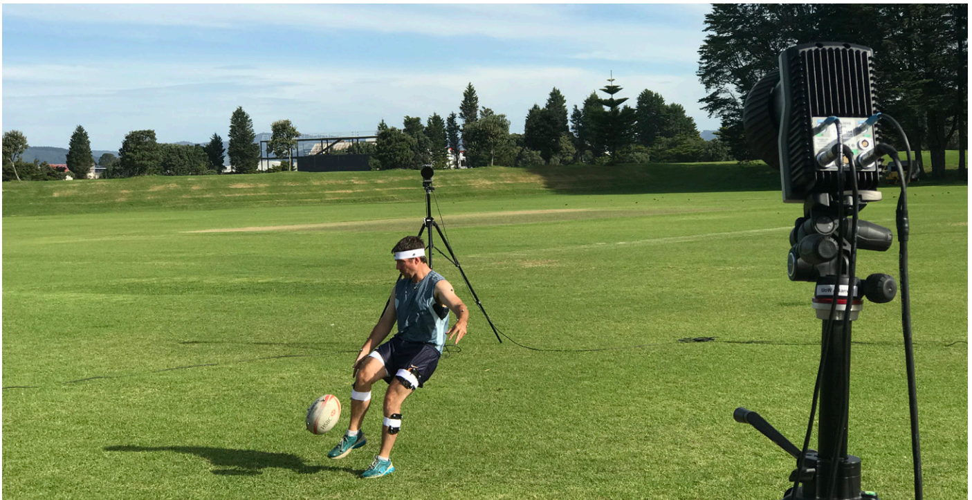
With the sun filter, 5+, 6+ and 7+ perform well even in extreme sunlight.